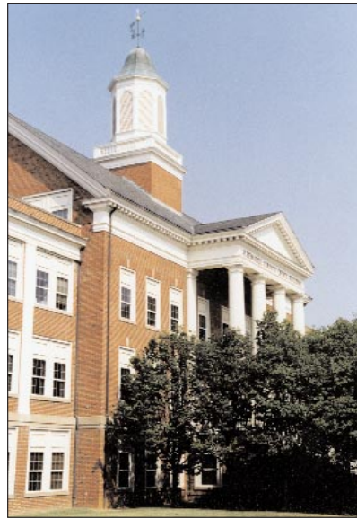
Albemarle County Office Building

Planning-District 10 (Thomas Jefferson), which includes Albemarle County, had total receipts in the beef cattle and calf industry of $17,176,000. In 1997 the census indicated 440 farms with 15,818 head of cattle.