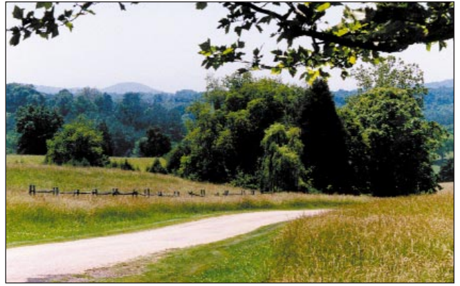
Albemarle County Countryside

Highways: Interstate 64 runs east and west intersecting with I-95 in Richmond, I-85 in Petersburg and I-81 in Staunton. Complemented by Route 29 North/South and Route 250 East/West, this network links Charlottesville and Albemarle County to all major east coast markets.